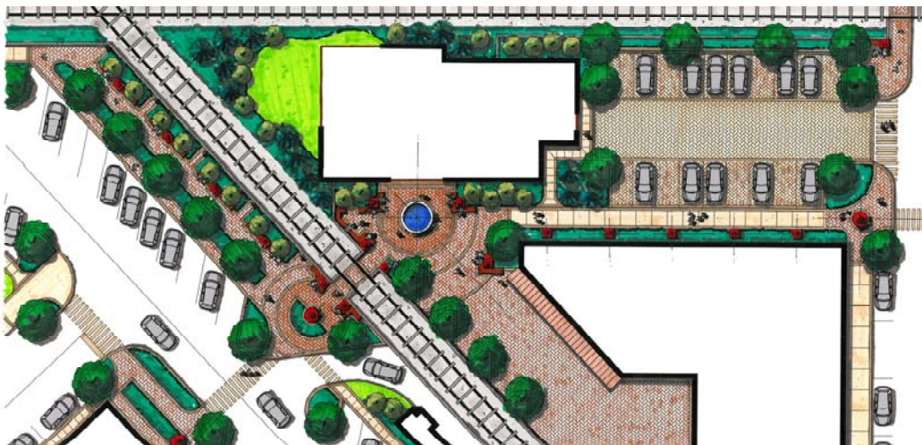
Updated Concept for Depot Re-use