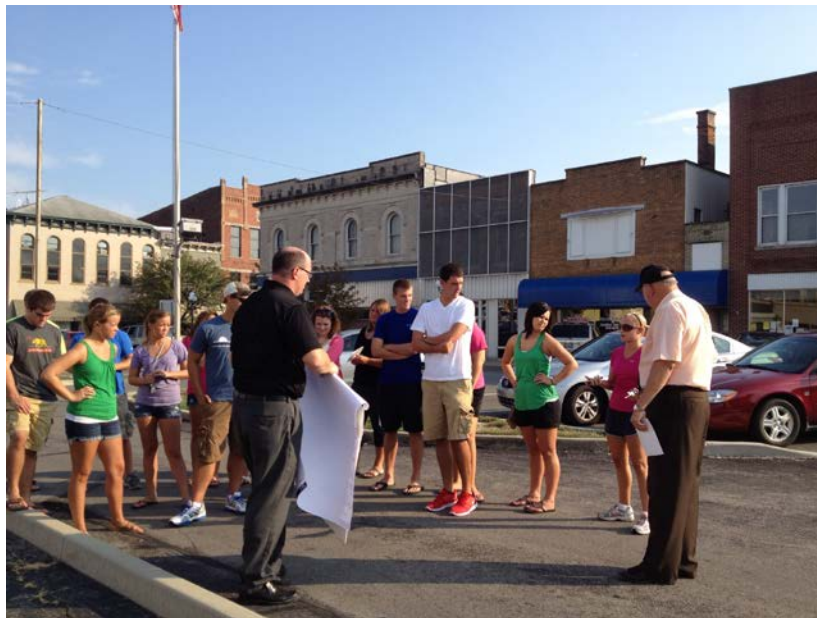
Youth Focus Group Meeting #2 – July 29, 2012